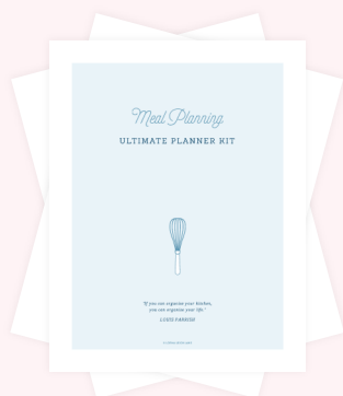
Meal Planning Ultimate Planner Kit