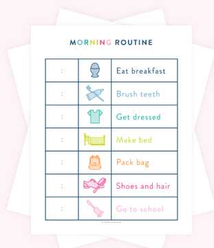
Custom Kids Morning Routine Chart